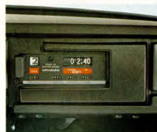
A taximeter and a two-way radio can be fitted in the glove compartment and the centre console

sole for a two-way radio. In the glove compartment there is room to fit a taximeter. A spacious pocket in the door panel provides plenty of extra storage space. The new one-piece side windows and the large rearview mirror provide even better and more convenient vision to the sides and rear.