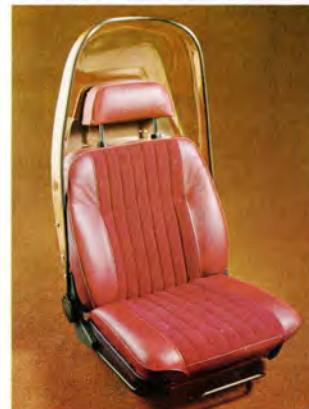
rest warm up the seat from 0–26°C in three minutes. This seat can be supplemented with a transparent driver protection cowl.

much as 80°. The door panels themselves are upholstered with durable vinyl material and the doors are fitted with scuff plates. The luggage compartment lid is fitted with a handle to facilitate opening and closing.