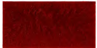
ANDES COPPER METALLIC