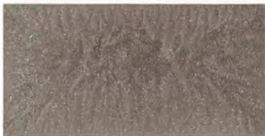
SAHARA BEIGE METALLIC