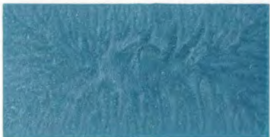
ALPINE BLUE METALLIC