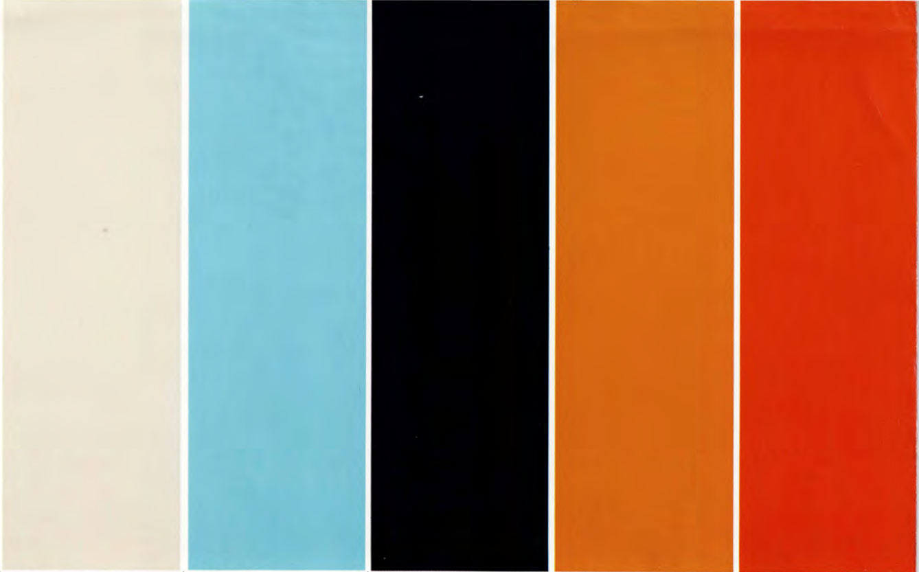
White Light Blue Dark Blue Yellow Orange

1) Volvo 164 E also available with brown crushed velour