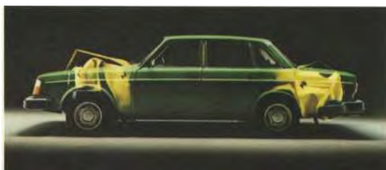
Front and rear ends have energy-absorbing crumple zones.

The Volvo bodies, for instance, are very strong and torsionally stiff. The passenger compartments are designed as a safety cage and the front and rear ends are energy-absorbing.