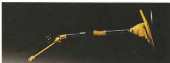
The steering mechanism: many ingenious safety features.

The Volvo bodies, for instance, are very strong and torsionally stiff. The passenger compartments are designed as a safety cage and the front and rear ends are energy-absorbing.