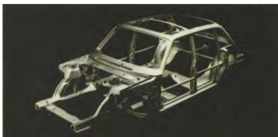
closed section profiles form a reliable safety cage.

Over the years, Volvo has shown a deep interest in different aspects of car safety. As a result, many of the safety features introduced by Volvo, have been clearly ahead of legislation. All the Volvo car series are designed to give a high degree of safety and to avoid injuries to a great extent in case of an accident.